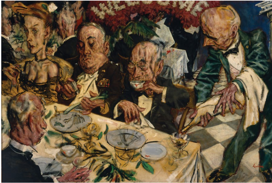
1. Jack Levine, Welcome Home, 1946, oil on canvas, 101.4 x 152.2 cm. Brooklyn Museum, New York, John B. Woodward Memorial Fund, 46.124.

work, entitled España , also from 1956 (fig. 3). 85 This engraving conveys the miserable living conditions endured by many in Francoist Spain. Both works confront the US government, which in its bid to fight communism had turned a blind eye to Franco's despotic regime. 86