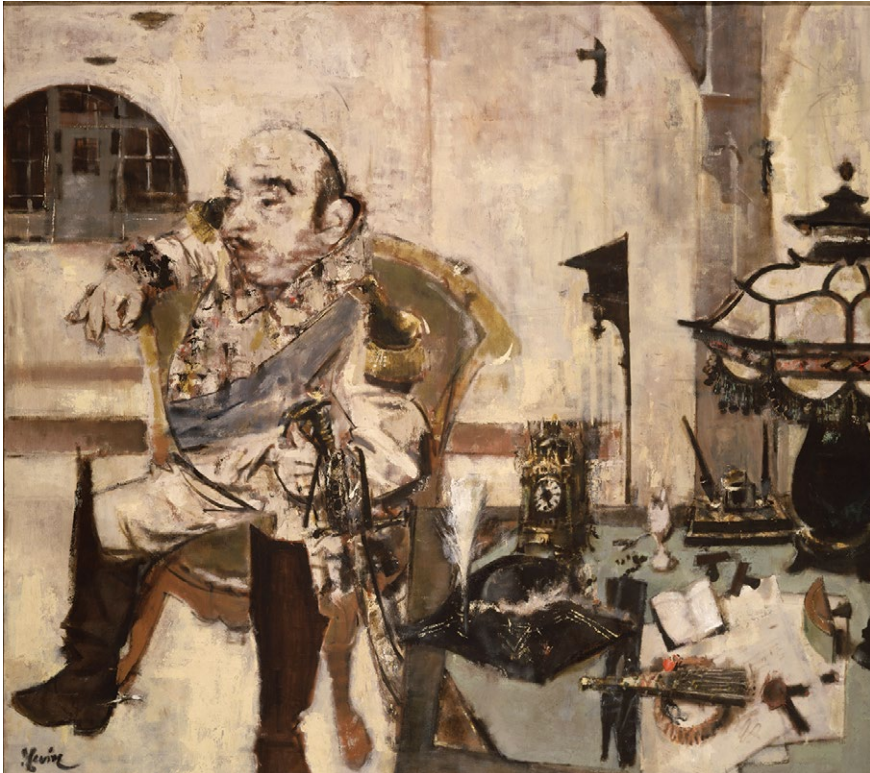
2. Jack Levine, The Turnkey, 1956, oil on canvas, 137.2 x 152.6 cm. Hirshhorn Museum and Sculpture Garden, Washington, D. C. Gift of the H. Hirshhorn Foundation, 1966.

for one year in Spain and France. As a result of that trip the artist was able to experience life in the country under Franco, and deepen his study of Spanish art. In a biographical essay, the critic Carl Zigrosser wrote that Lasansky: