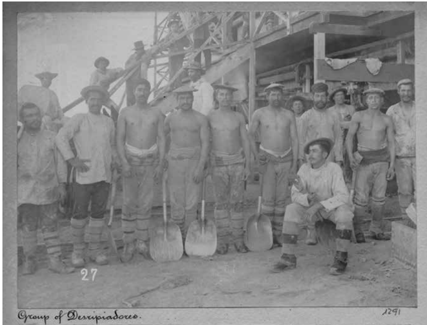
3. "Group of Descripiadores," in Oficina Alianza and Port of Iquique 1899, no. 27.