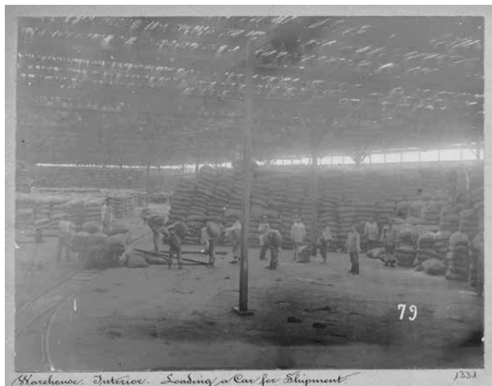
12. "Warehouse Interior. Loading a Car for Shipment," Oficina Alianza and Port of Iquique 1899, no. 79.