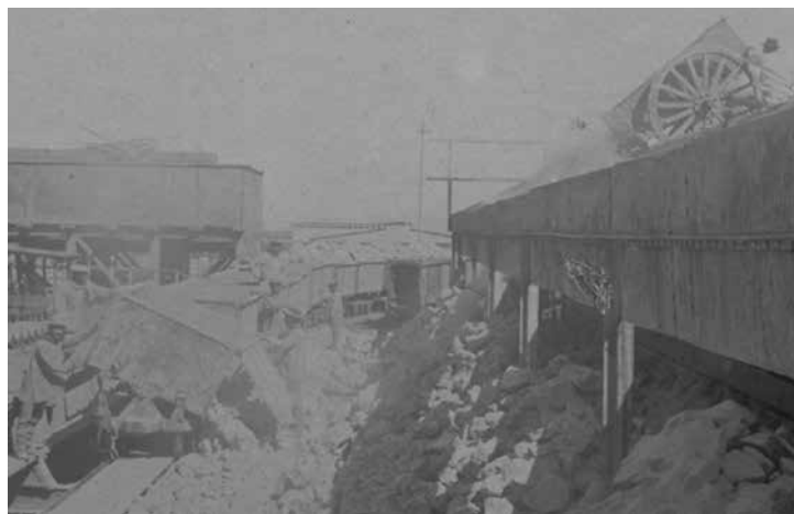
16. "Top of Caliche Hopper Carts tipping Caliche," detail.