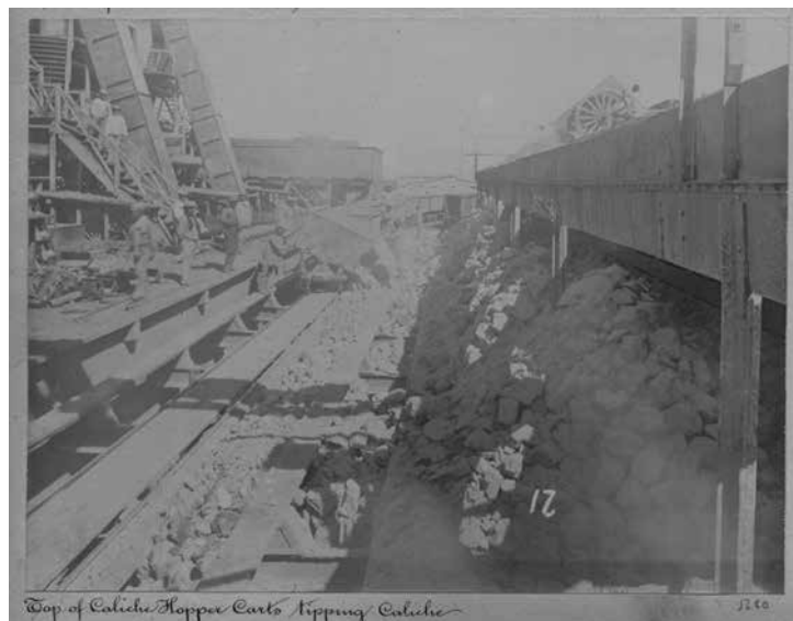
15. "Top of Caliche Hopper Carts tipping Caliche," in Oficina Alianza and Port of Iquique 1899, no. 17.