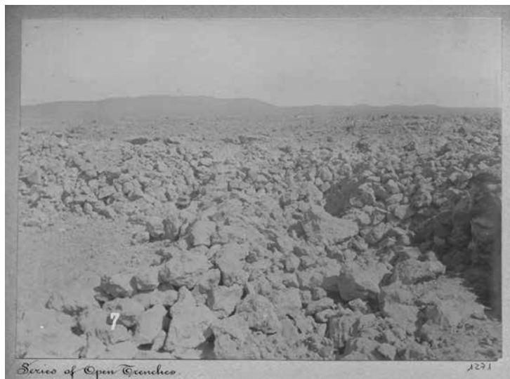
5. "Series of Open Trenches," Oficina Alianza and Port of Iquique 1899, no. 7.