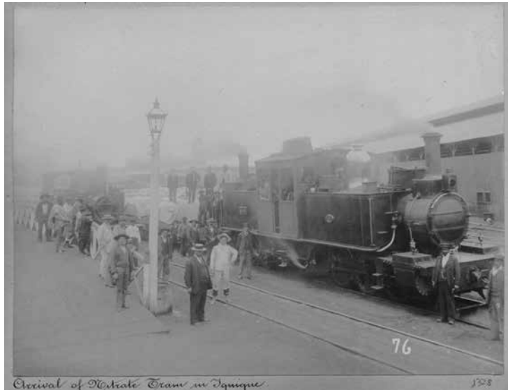
II. "Arrival of Nitrate Train in Iquique," Oficina Alianza and Port of Iquique 1899, no. 76.

into the desert vanishing to a point between them. Across from each other, the men look into the distance. The profile of their clothed bodies, the shape of their hats not their faces visible, indicates they turned away from the camera, encouraging the viewer to gaze as far as their eyes can see, to the vanishing point. The undisturbed surface of the empty desert spreads out before them. In this geographical time frame, there is no smoking chimney, no signs of industry. In the photographer's time, real time, if you like, he has simply pointed his camera away from the Oficina Alianza , the fully operational Oficina , that he was heading towards as he travelled on the train. He has produced another view of the desert seen as the Oficina's past; thus his sequencing of photographs becomes an account of the desert's industrialisation; it shows the industrial transformation of the Atacama desert as a historical as well as daily operation.