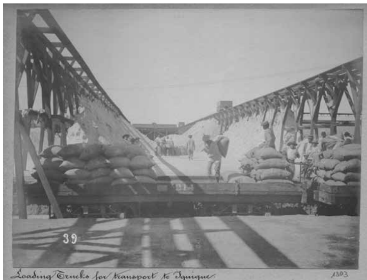
7. "Loading Trucks for Transport to Iquique," Oficina Alianza and Port of Iquique 1899, no. 39.