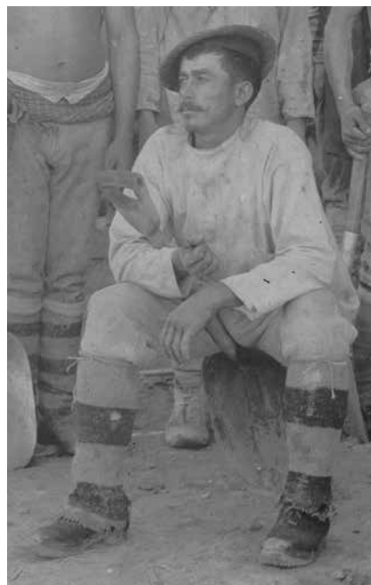
20. "Group of Desripiadores," detail.

at his camera but look to their left: the seated figure in the foreground and an upright figure parallel to him, behind the row of nitrate workers. They seem to be looking at the same thing or the same person; they wait for the photograph to be taken, the moment to pass, to then perhaps receive a sign from the foreman, el capataz , to get back to work.