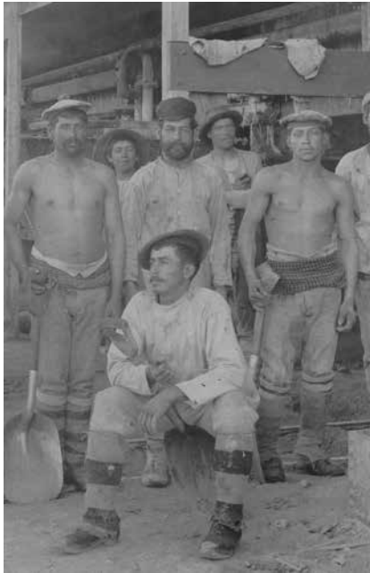
21. "Group of Descripiadores," detail.