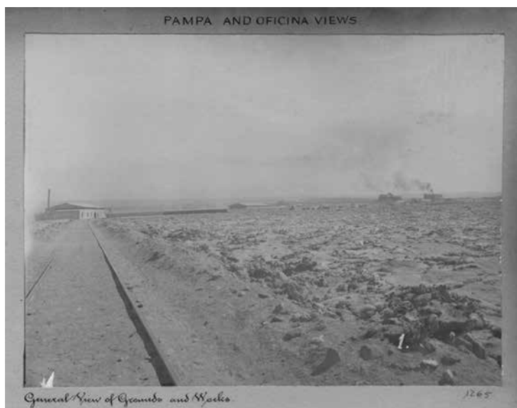
6. "General View of Grounds and Works," Oficina Alianza and Port of Iquique 1899, no. 1.