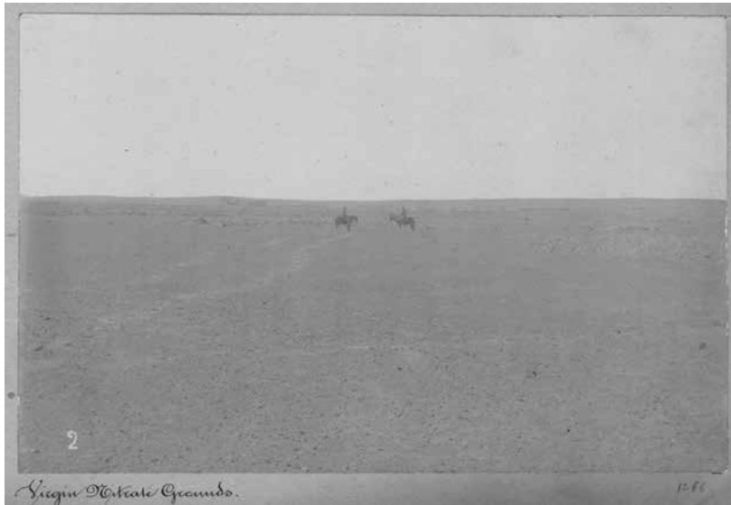
14. "Virgin Nitrate Grounds," Oficina Alianza and Port of Iquique 1899, no. 2.

the crusher's hopper) extend from bottom left to centre providing lines of perspective around which the image's elements are drawn into symmetry and balance. Steep sided structures, exposed constructions reproducing metal forms, rise on either side of the tracks. Industry lies between, represented by activity and quantity, productivity, to use a term taken from Economics. Men engage in purposeful stances within the industrial architecture and oversee mounds of materials. At the very centre of the image, where lines of perspective converge, is its defining moment, a stage for the industrial process' announced by the title: "Top of Caliche Hopper Carts tipping Caliche." Three men reach and hold the cart as dusty rocks pour from the bottom and spill from the top (fig. 16). The foremost figure's face, whose leaning body is aligned with the cart to become part of the shape and movement of the tipping caliche, is turned upwards towards the camera. His glance punctures the image, alerting its viewers, us, that this moment is being presented. But the image's other elements combine to encourage the dismissal of his stare, and the challenge it implies, in favour of the documentary requirements of nineteenth century industrial photography. The cart and its handlers might have paused for the camera but the heavy loads stacked behind them ratify that the sight of a tipping cart