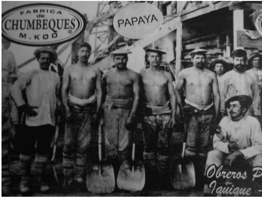
4. Box of Biscuits from local Iquique shop, 2012.

building. Entitled “General View of Grounds and Works” (fig. 6), the image prepares the viewer for the following 90; it sets the scene, indicates everything that is in store.