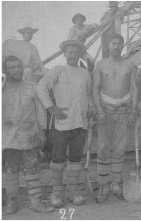
19. "Group of Desripiadores," detail.

photography (the interruption of their routine by the photographer's arrival, the installation and adjustment of his equipment), some men cooled and dressed, or others felt the heat of the day and undressed. Two white shirts hang over the wooden structures supporting the Oficina's boiling tanks, the collarless one, a worker's garment, just visible. Unintentional or otherwise, this is a show of strength: physical, manual, masculine. That much can be seen but its meaning is not clear, neither in 1899 nor now. Classical and primitive subjects wear bare chests in all kinds of imagery from sculpture to comic strips: ancient warriors and colonial peoples.