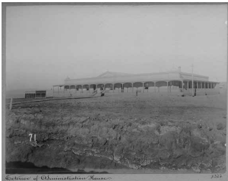
10. "Exterior of Administration House," Oficina Alianza and Port of Iquique 1899, no. 71.