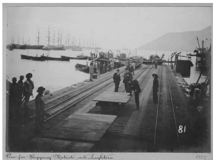
13. "Pier for shipping Nitrate into Lighters," Oficina Alianza and Port of Iquique 1899, no. 81.