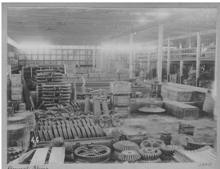
9. "General Stores," Oficina Alianza and Port of Iquique 1899, no. 44.