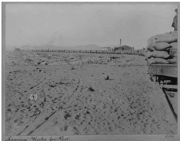
8. "Leaving Works for Port," Oficina Alianza and Port of Iquique 1899, no. 40.