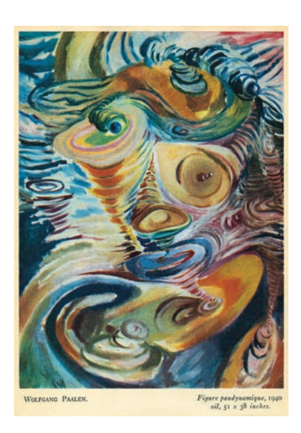
4. Wolfgang Paalen, Figure pandynamique, 1940, oil on canvas, 51×38 inches. Printed in DYN , no. 1, April-May 1942, p. 6.

of the American cultures, as "anti-cosmic," "isolating man and his god in the universe" and as not tolerating "totemic survivals except in fairy tales and armorial bearings." For Paalen the transformation of the totemic mentality into "the personage of a powerful god" moved "according to a process of centralization of the idea of power which goes hand in hand with a progressive centralization of political power." It is, perhaps, within this critique that Paalen's appreciation of the failure of religion can be located which, in his view, had left art as the only alternative to creating a new humanism.