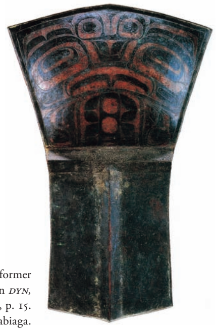
Chiseled and painted copper-plate. Haida former collection of Wolfgang Paalen. Printed in DYN, Amerindian Number, nos. 4-5, December 1943, p. 15.

scientific in their aims, anthropological theories such as this radical diffusionism were used by some authors to highlight their political implications. Rivet, for example, thought that these ideas could exalt and fortify a much needed human solidarity: "Every man should understand and know, that in all latitudes and in all the longitudes, other human beings, whatever the color of their skins or the form of their hair might be, have contributed toward making life sweeter and easier for him." <sup>38</sup>