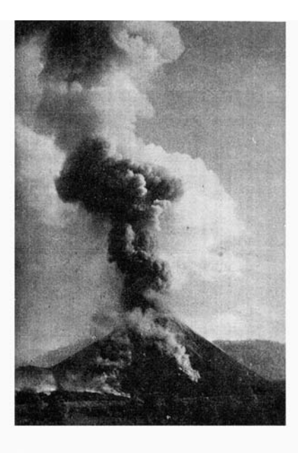
The volcano Paricutin. March 1943